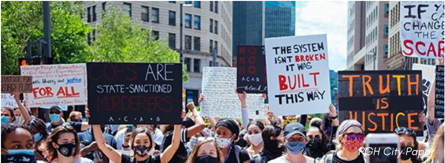
PGH City Paper