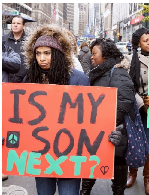
Nobel Women's Initiative